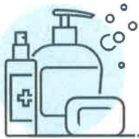
personal care kits

Get FREE support during isolation and quarantine for COVID-19!