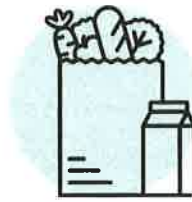
fresh food orders delivered to you