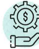
financial assistance for paying bills*