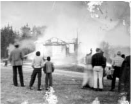
ON CHRISTMAS EVE OF 1944, THE SINCLAIR PARK COMMUNITY CHURCH BURNED DOWN. IT WAS BELIEVED THAT SOMEONE SET THE CHURCH ON FIRE. THE CHURCH WAS BUILT BY THE RESIDENTS AT SINCLAIR PARK AND WAS LOCATED ON THE CORNER OF LATONA STREET.

As the community grew, the need for a local, accessible church became imperative for the residents. In August 1943, the Bremerton Housing Authority signed a lease with the Negro Baptist Church for a building site within Sinclair Park, with provision to remove the building within sixty days of the termination of the lease. The community church provided an important, readily accessible social and spiritual center for neighborhood residents of all denominations. Later the Hill Top Baptist Church, the precursor to the Mount Zion Baptist Church, was formed.