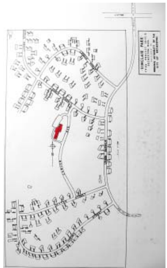
UNDATED MAP OF SINCLAIR PARK COMMUNITY PREPARED BY THE HOUSING AUTHORITY OF THE CITY OF BREMERTON. THE COMMUNITY BUILDING IS LOCATED BETWEEN THE TWO ARMS OF HOUSING ON CARRER AVENUE. MAP COURTESY OF THE KITSAP COUNTY HISTORICAL SOCIETY MUSEUM.

Sinclair Park was located on a hillside site to the west of downtown Bremerton and the Naval Shipyard. Assigned the military project number WA-112B, the neighborhood was laced over an 80 acre site with 280 family dwellings configured in single story, frame buildings grouped in a “C” shaped cluster. By 1944, approximately twenty-one units were occupied by enlisted personnel, with civilians living in the rest. 14 The modest buildings were produced by Prefabricated Products Company of Seattle under a contract let on June 5, 1942. By late summer that year, the site was graded, the manufactured panels that made up the houses were assembled and the neighborhood was ready for occupancy. The first residents, Eugene Aires and Elwood Greer, arrived in March of 1943. Mrs. Greer arrived in June of 1943. 15 At the south edge of the housing cluster, a small wood frame building was constructed to serve as a rent collection and management office. The use patterns of the small neighborhood along with the lively social needs of the residents soon led to the planning of a larger, more permanent, centrally located building.