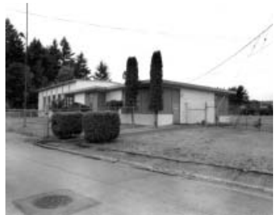
VIEW OF NORTH END AND EAST FRONT. (SEPTEMBER 2002).