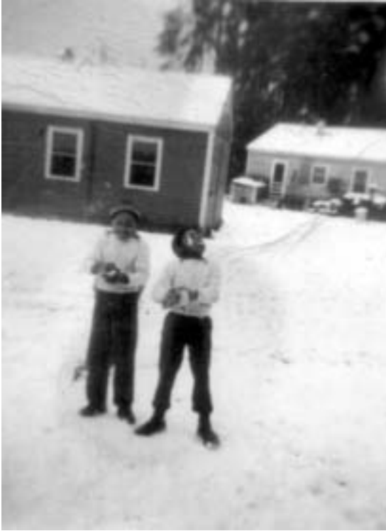
PHOTOGRAPH TAKEN IN THE WINTER OF 1944. AFRICAN AMERICAN CHILDREN IN SINCLAIR PARK PLAYED IN THE SNOW FOR THE FIRST TIME. MANY CAME FROM THE SOUTH AND SOME OF THEM HAD NEVER SEEN SNOW BEFORE SO THIS WAS A SPECIAL DAY FOR THEM. THE SCHOOLS ALLOWED THEM A DAY OFF.