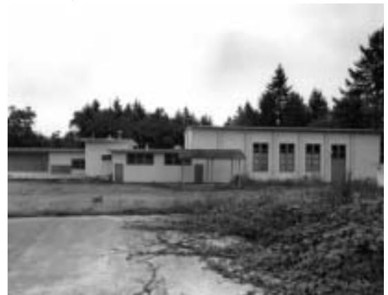
VIEW OF WEST BACK. (SEPTEMBER 2002).