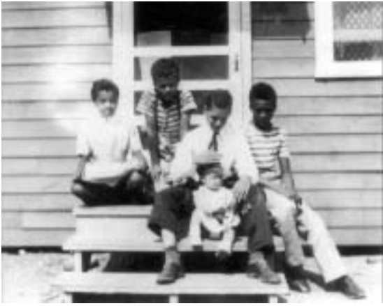
FIG. 3. QUINCY JONES, ET. AL.