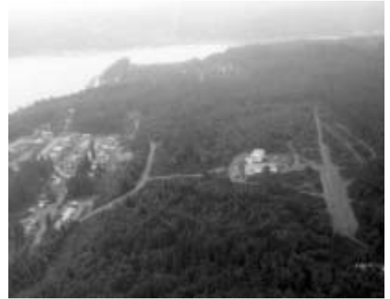
CA 1970s AERIAL VIEW OF SINCLAIR PARK, LOOKING SOUTH.

By 1948 the neighborhood had vanished leaving only the streets, sidewalks and the Community Center Building. A Quit Claim Deed in November of 1950 released claim of the site (approximately 183 acres) from the Public Housing Administration to the State of Washington for National Guard purposes only. Over the ensuing years, the Washington Military Department altered the building to meet their changing needs. In 1954, the adjacent Bremerton National Guard Armory (9,837 gross square foot) was constructed. The land was annexed to the City of Bremerton to provide municipal services. A public park facility was located immediately west of this property and used for day uses and athletic events. The City of Bremerton also erected a water tower on the site.