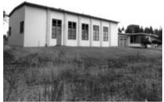
VIEW OF EAST FRONT AND SOUTH END. (SEPTEMBER 2002).

The Sinclair Park Community Center and the neighborhood it was built to serve were the products of the Second World War and America's west coast response to the war in the Pacific. While the Depression of the 1930s fragmented the nation's social fabric and scattered people on the winds of economic uncertainty, the coming of World War Two brought an immediate and unifying sense of sober purpose. On the Pacific Coast, where sites braced for aerial assault after the Japanese bombing of Pearl Harbor, major staging points for the War in the Pacific were built or expanded by the military. In the protected waters of Puget Sound, there was a concentration of war production facilities around the deep water harbor of the historic Bremerton Naval Shipyards.