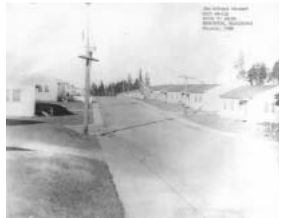
PHOTOGRAPH OF SINCLAIR PARK, WA45-112, JANUARY 1948.

The population of Bremerton itself was recorded at 15,134 in the 1940 census. At end of war, the figure determined by local postal records climbed to 82,227. 6 Although an optimum employment figure for the shipyard was set at 36,000, this figure was never reached due to housing shortages. Several times recruiting had to be slowed and even stopped as available housing filled to capacity. 7 Turnover of workers also became an employment issue. Approximately 95,000 new workers were hired during the war, yet the Yard never reached its optimal employment. The average workforce for this period remained at 23,600. 8 The Yard was continually losing workers who took jobs closer to where they lived in Seattle, Tacoma and other nearby cities and towns. Limited housing, high rents and inflated living costs were the most commonly cited reasons.